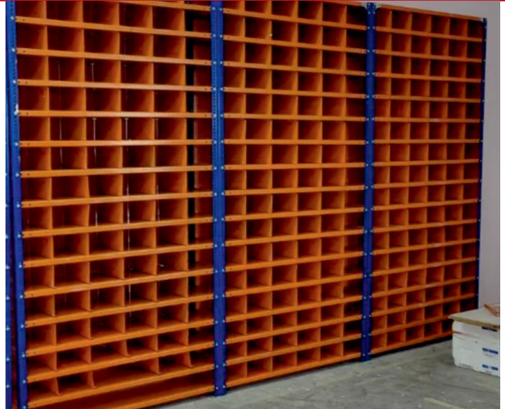
Region Hole Racks