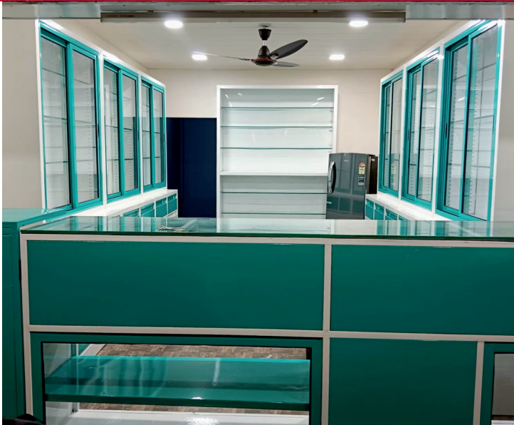
Medical Shop Racks